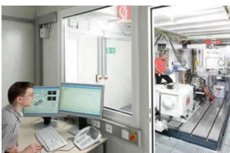
In-house test bench