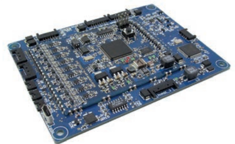
In-house developed inverter controlboard

Flexible control prototyping hardware is also used during the development stage (all with a consistent tool chain based on MATLAB/ Simulink):